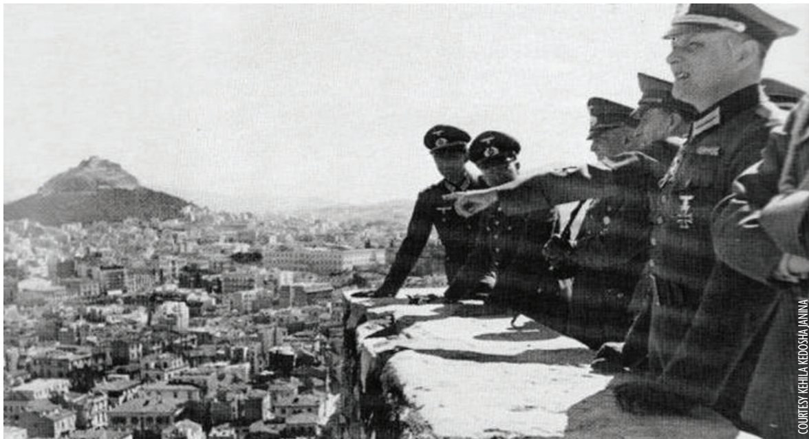
◀ TOP: NAZI OFFICERS NEXT TO THE PARTHENON ON THE ATHENIAN ACROPOLIS

In 1940 the community numbered 3,500 souls. Under the Italian administration, the Jews enjoyed three years of relative security. The fall of Mussolini on July 24, 1943, led to the September 1943 German takeover of Athens. On March 25, 1944 German officials rounded up 1,690 Athenian Jews for deportation to Auschwitz-Birkenau. The Italians had contributed to the rescue of sixty-six percent of Athens' Jews.