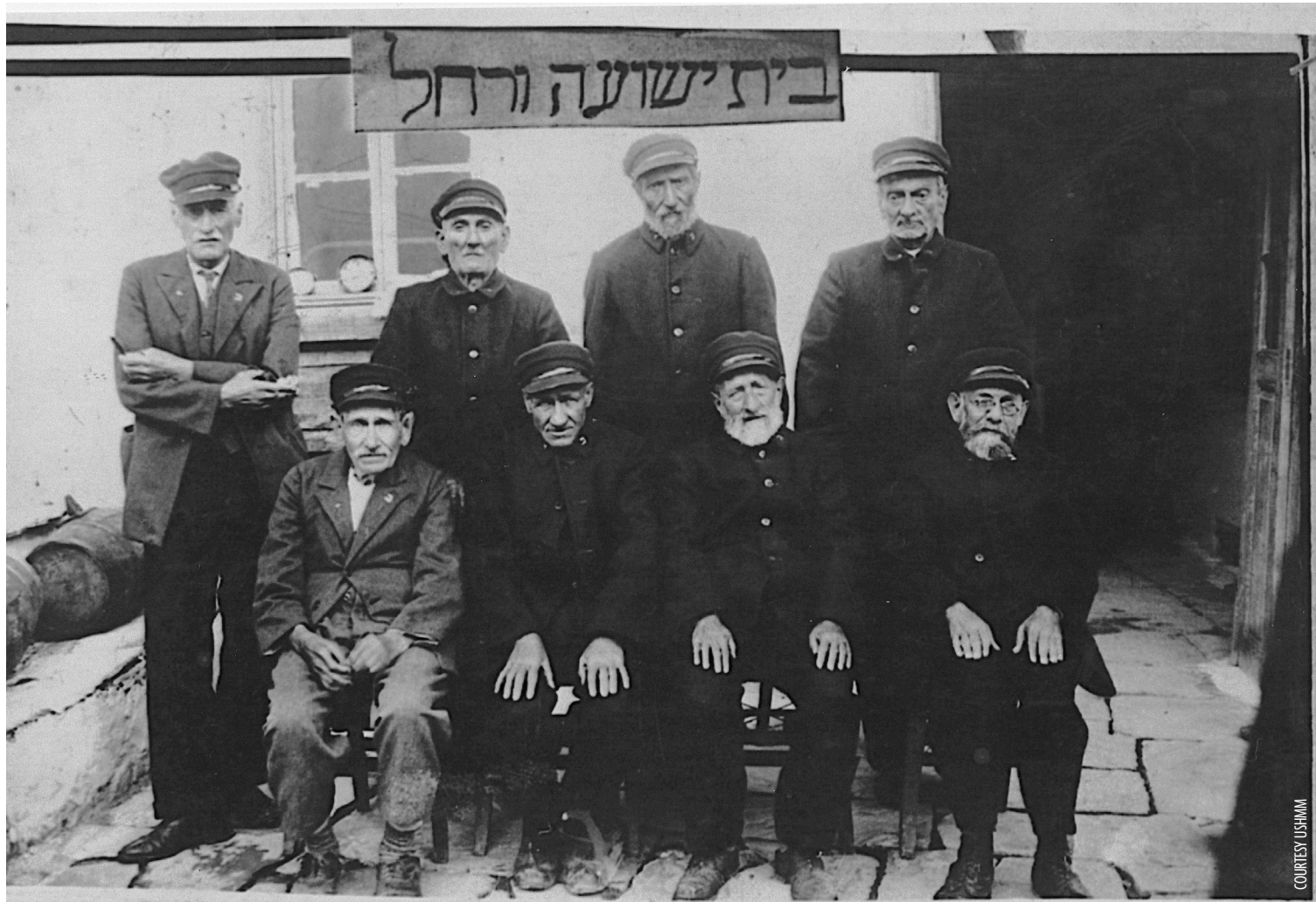
◀ A GROUP OF IOANNINA'S ELDERLY POSE IN FRONT OF THE OLD AGE HOME YESHUAH V'RACHEL. THE PICTURE WAS TAKEN IN 1940. IT IS ASSUMED THAT ALL THE JEWS OF THE HOME WERE DEPORTED AND PERISHED.

T HE FIRST German troops, members of the Adolf Hitler division, entered Ioannina on April 20, 1943. They stayed for twenty days, leaving the city once more under the more benevolent Italian rule. The Jews did not experience any discrimination until Italy surrendered in September 1943.