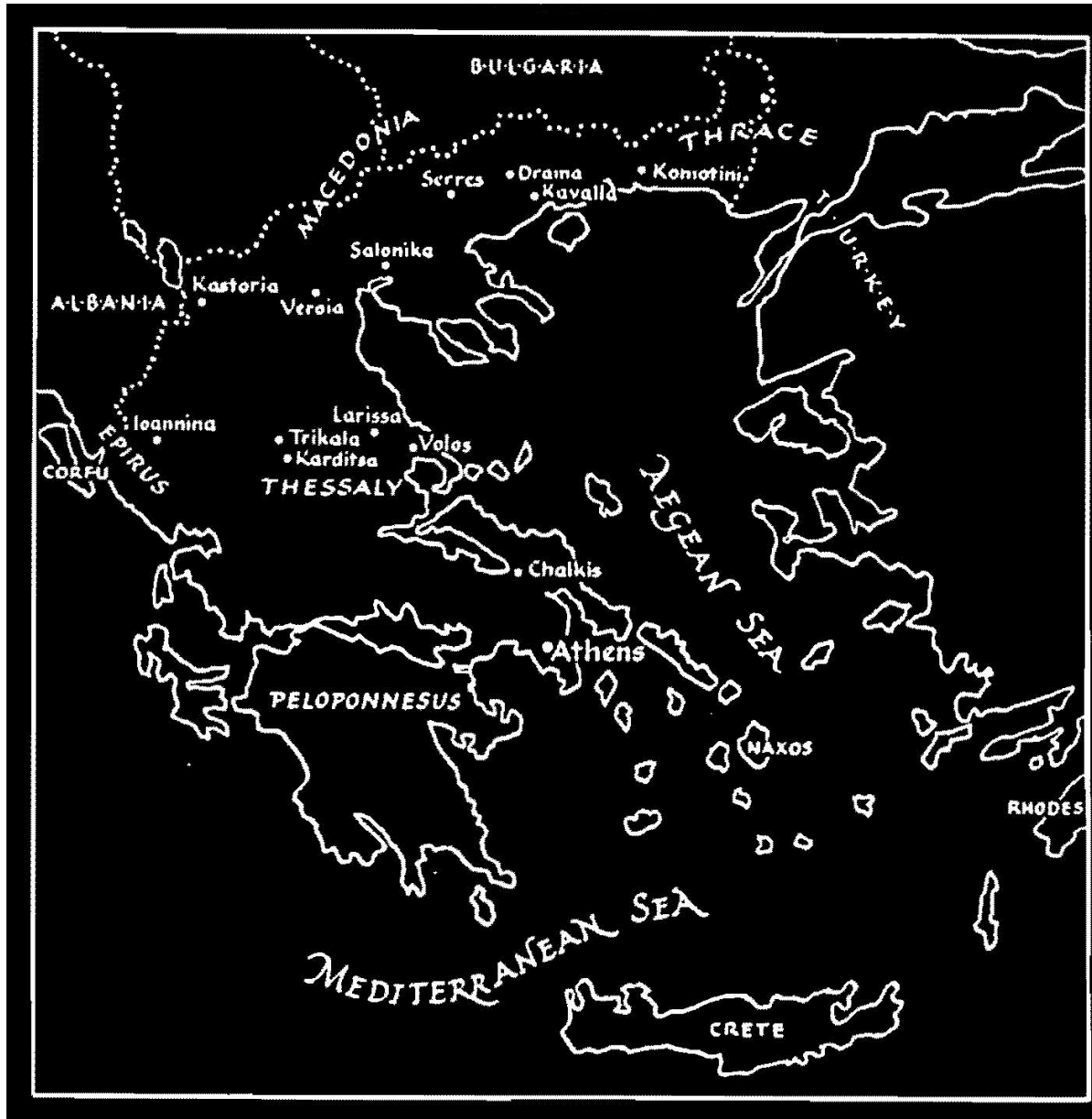
▲ MAP OF GREECE.

G REECE ENTERED World War II on October 28, 1940, when the Italian army invaded from Albania, beginning the Greco-Italian war. The Greek army was able to stop Mussolini's expansionist goals and even pushed the Italians back into Albania. The Greek successes and the inability of the Italians to reverse the situation brought Nazi Germany to intervene in order to protect her main Axis partner's prestige. The German invasion of Greece took place on April 6, 1941.