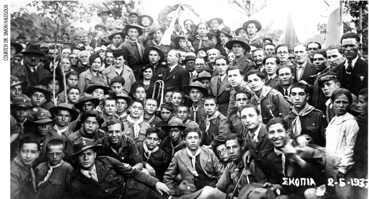
▲ ABOVE: THE "MACCABEES" WAS A JEWISH BOY SCOUT TROUP IN SALONIKA. THIS POPULAR AND ACTIVE ORGANIZATION WAS AN IMPORTANT PART OF THE JEWISH COMMUNITY. THIS PICTURE WAS TAKEN IN 1937 ON A CAMPING TRIP AT THE YUGOSLAV/GREEK BORDER. ASIDE FROM THE TYPICAL CAMPING SCOUT ACTIVITIES, THIS ZIONIST ORGANIZATION HAD ORGANIZED SPORTS, ORCHESTRAL BANDS, AND REPRESENTED THE JEWISH COMMUNITY AT VARIOUS FUNCTIONS INCLUDING MARCHING IN GREEK PARADES. THE MACCABEES IN SALONIKA ALSO ORGANIZED HELPING REFUGEES FROM EASTERN EUROPE DURING THEIR MIGRATIONS TO PALESTINE. THE GREAT MAJORITY OF THE SCOUTS IN THIS PICTURE PERISHED IN THE HOLOCAUST.